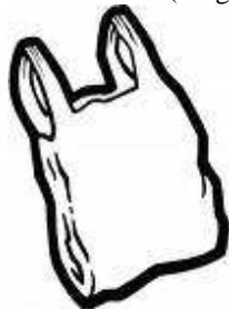
Plastic Bag Towel